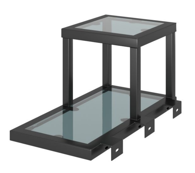
Shown Left Hand